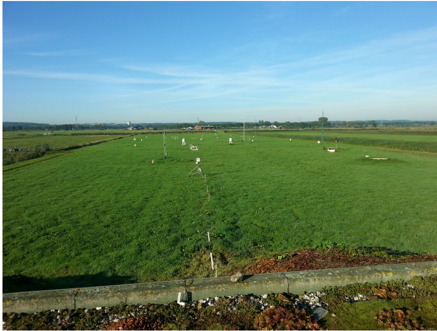
Meteorological Station de Veenkampen ( http://www.met.wau.nl/veenkampen/graphs/cur/graphs.html )