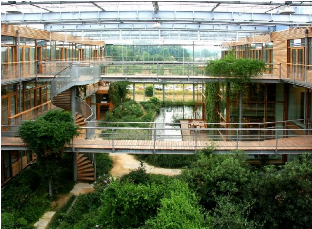
Lumen building at Wageningen University

It will take place in the Lumen building, room “Lumen 1”.