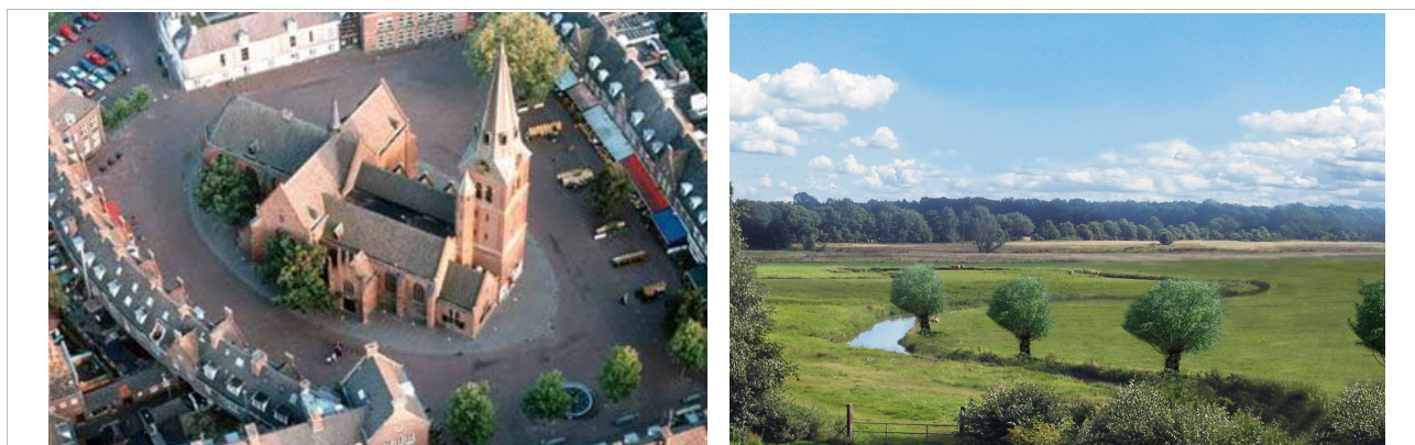
Wageningen market place (left) and at 200m distance the river foreland of the Rhine (right)

The objective of the workshop is to interact around our ongoing studies, work together on specific issues and analyses, and discuss new perspectives.